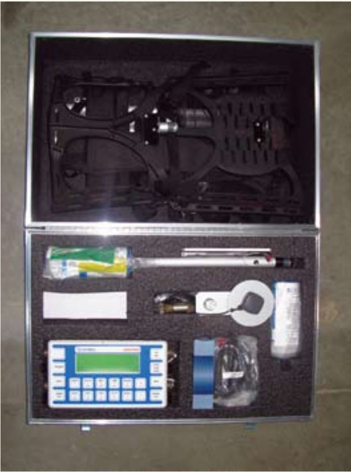
■ Envi Pro system package